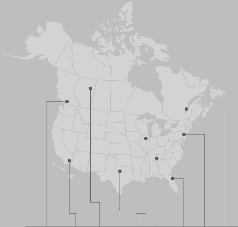
BRITISH COLUMBIA • CALIFORNIA • ALBERTA • TEXAS • ILLINOIS • TENNESSEE • FLORIDA • NEW JERSEY • QUEBEC