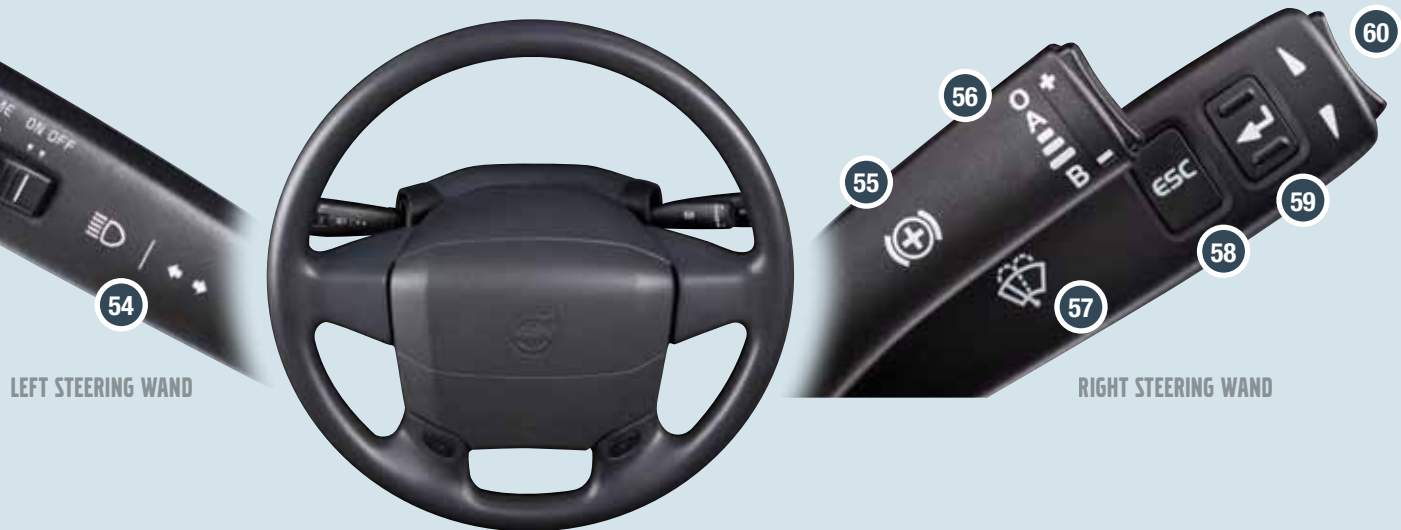
LEFT STEERING WAND